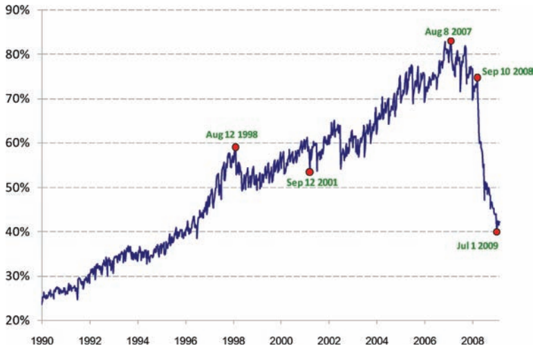
Figure 3. Repos and Financial CP as a Fraction of M2 (weekly)